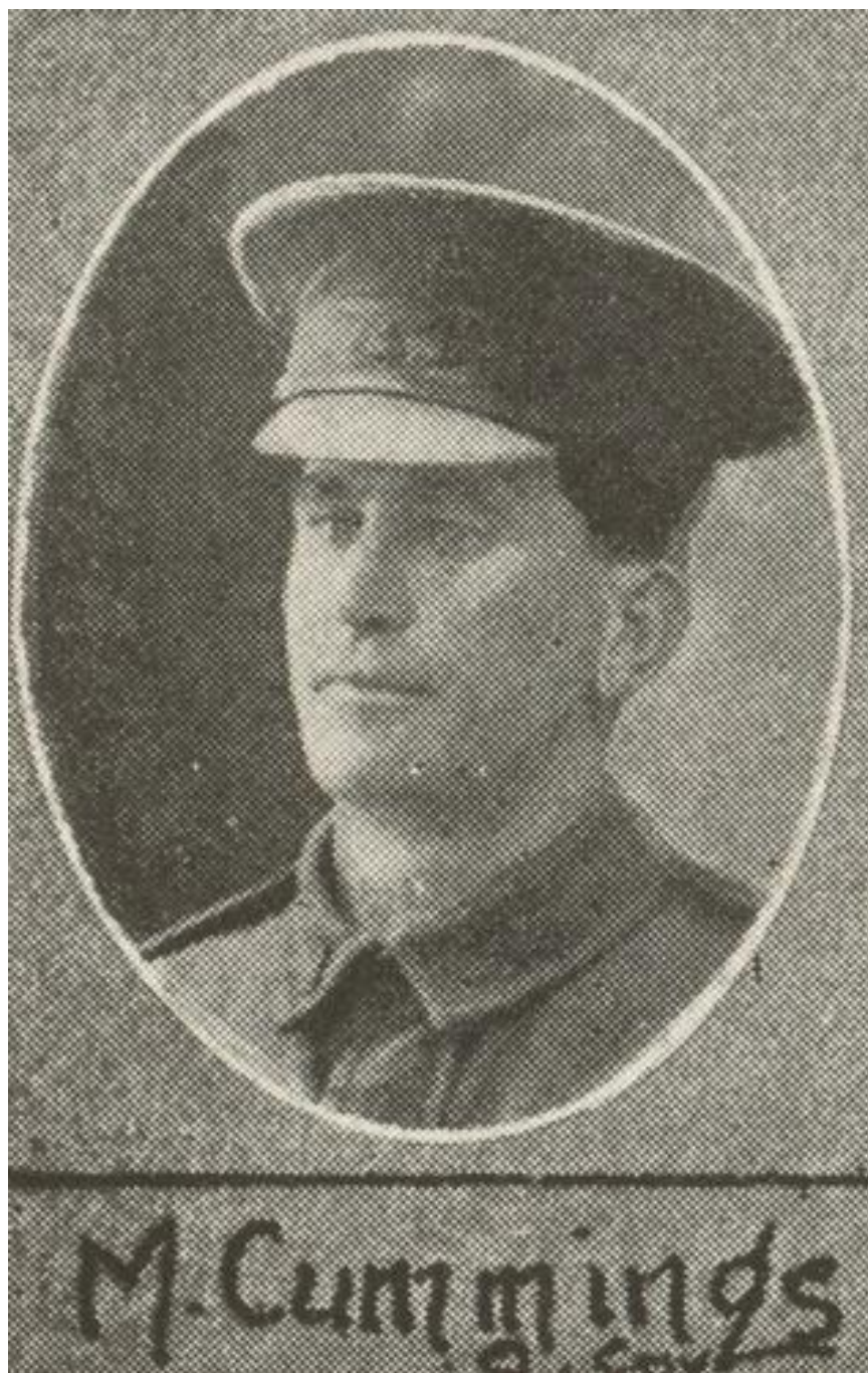
(The Queenslander Pictorial, supplement to The Queenslander 24 March, 1917)

Information obtained from the Australian War Memorial (Roll of Honour, First World War Embarkation Roll) & National Archives