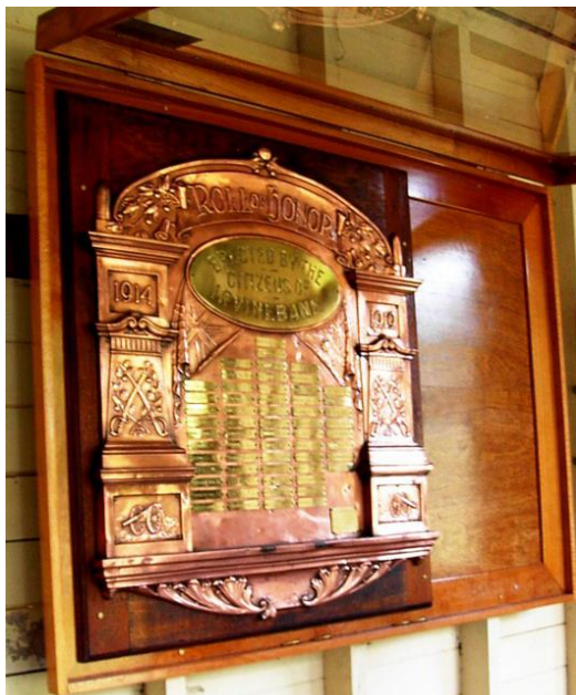
Irvinebank Roll of Honour